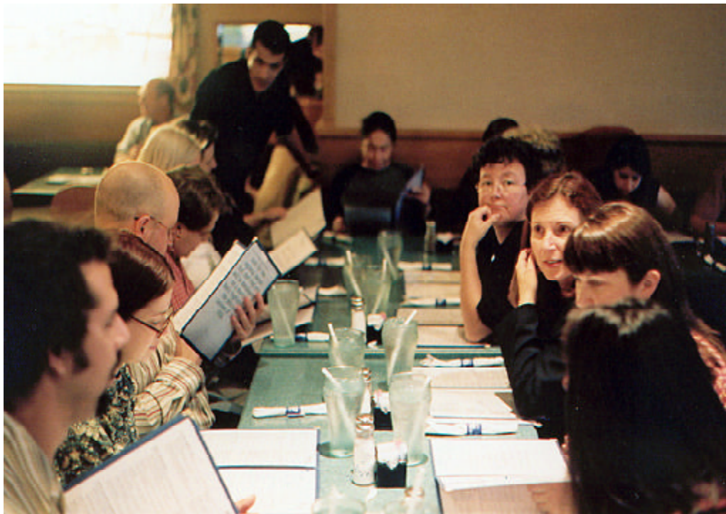
Thirty-five Section members made the trek to the Airstream Diner in Beverly Hills to partake in the annual dinner.

distinct organizations from across King County into one comprehensive, searchable database. Each group maintains its own digital collection, yet all are virtually combined at < www.kcsnapshots.org >. Funding for this project came from the federal government's Institute of Museum and Library Services in the form of a 2001 National Leadership Grant.