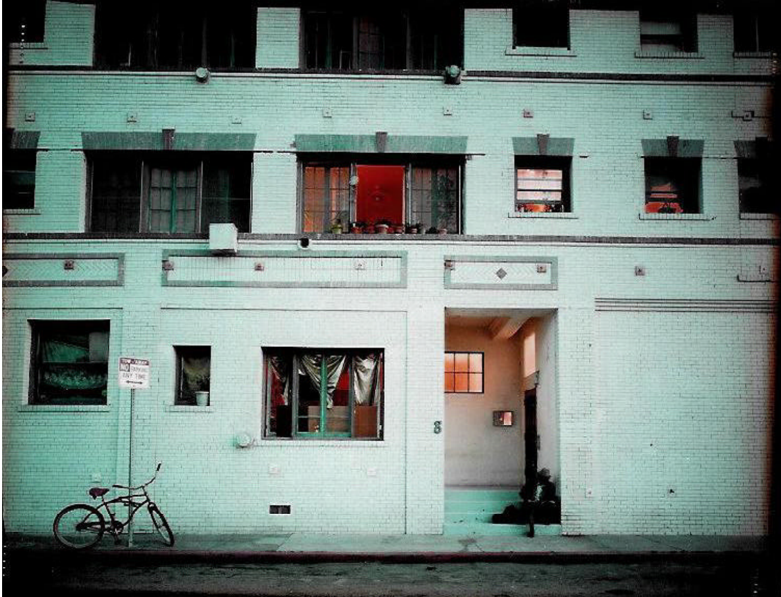
The Fenmar Apartments Bldg. on Brooks Ave., a few months before it was seriously damaged in a huge fire. Taken between July 2002 and August 2003 as part of the Los Angeles Public Library's Neighborhood Project. [This, and other photographs, are in color in the online edition of Views.—Ed.]