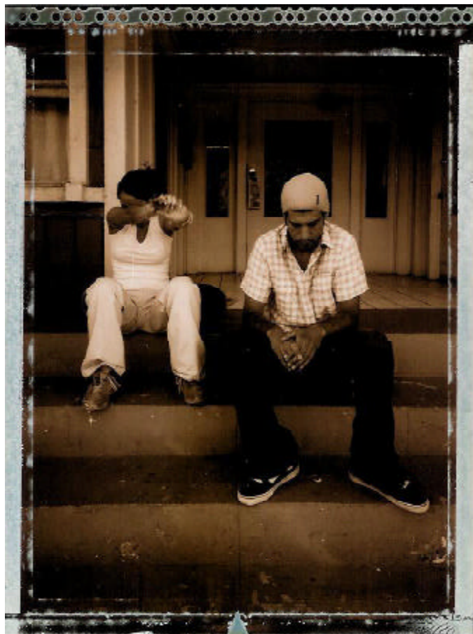
Summer 2003 on the porch of 209 Venice Blvd. Taken as part of the Los Angeles Public Library's Neighborhood Project.

We started our discussion by focusing on our desired goal: an archive of photographs that documented the hundred or so neighborhoods within the City of Los Angeles.